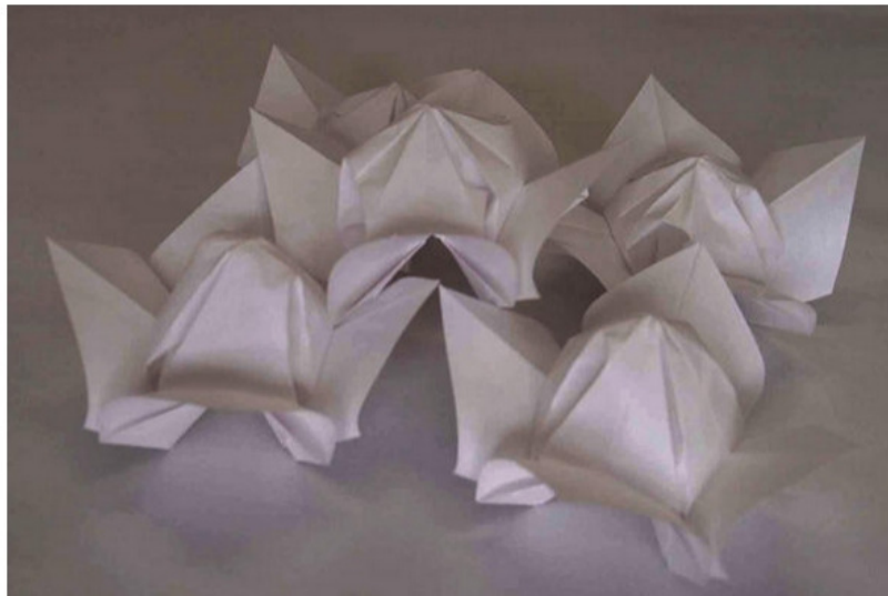
Fukushima and Iwate

Fukushima and Iwate Project - In December 2014 I was invited by the nonprofit organization 岩手未来機構 ARTproject from Japan to present my work and organize series of workshops and lectures in Fukushima and Iwate prefectures. This organization supports creativity in damaged areas of Fukushima and Iwate hit by the terrible earthquake and tsunami catastrophe of 2011 by bringing international creative professionals on the site to present their work and create inspirational projects to inspire students from those areas. This organization is supported personally by the minister of ecology of Japan.